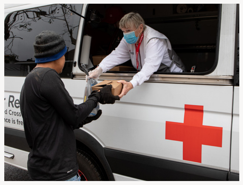
The American Red Cross name and logo and copyrighted materials are used with its permission, which in no way constitutes an endorsement, express or implied, of any product, service, company, opinion or political position. The American Red Cross name and logo are registered trademarks owned by the American National Red Cross. For more information about the American Red Cross, please visit redcross.org.

The foundation formed strong ties with the National Compassion Fund and other victims' assistance funds last year to help our communities heal after tragedies.